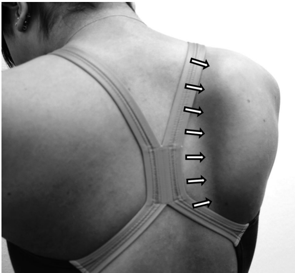
Fig. 1 Winging of the scapula is apparent when the patient is pushing forward. The arrows show winging of the scapula.

One year after beginning therapy, the right shoulder girdle pain and paresthesia had disappeared. MMT and joint ROM improved, although not completely. The subject's MMT and ROM grades 1 year after beginning therapy are listed in ►Tables 2 and 3, respectively. However, when shoulder abduction was 0 degree, downward rotation of the right scapula was prominent. Furthermore, WPT resulted in a distinct dorsal protrusion of the scapula, and winging of the scapula remained (►Fig. 1).