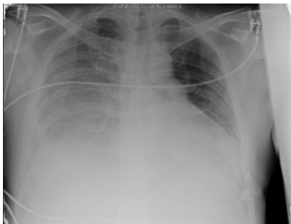
Fig. 1 Chest X-ray before LVAD implantation.

The reduction of blood loss is a goal for all surgeries. Especially LVAD implantations are considered to be prone to high blood loss