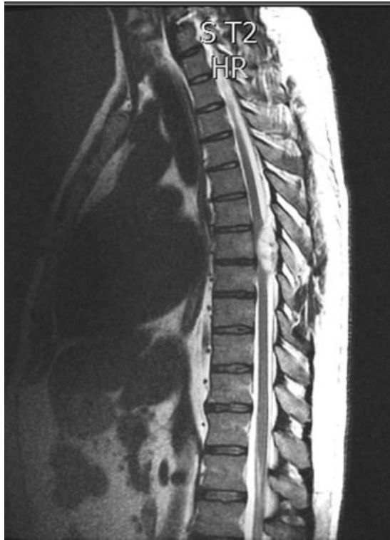
Fig. 2 Magnetic resonance images. Sagittal view. An epidural lesion at the level of T7–8 presented intense postgadolinium enhancement. Signal flow voids may be noticed, indicating that the lesion was probably highly vascular.

He underwent a T6–8 laminectomy, bilaterally. Radioscopy was used to identify the level to be approached. Electrophysiological monitoring was employed to minimize the risks of neurological worsening. After laminectomy, a reddish epidural mass that extended into the right T7–8 foramina was revealed. We noticed two feeding vessels in its superolateral aspect, which we dissected and coagulated. They were soft upon manipulation and we completely resected after circumferential dissection. Then, we removed