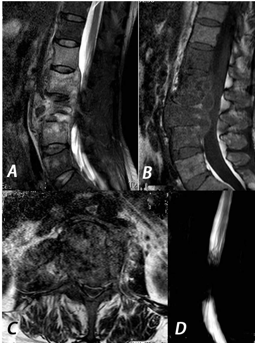
Fig. 1 (A, B) Magnetic resonance T2- and T1-weighted images in sagittal view showed involvement of L2–L4 vertebrae with reduced disk space and the lumbar spinal canal. (C, D) Axial section of the same patient showed destruction of L2–L4 vertebrae with a giant cold abscess on the right side and magnetic resonance myelogram showed the lumbar spinal canal was compression remarkable.

(► Fig. 2 ). A diagnosis of spinal tuberculosis with abdominal pain was made. Conservative treatment was planned. Anti-tuberculosis treatment with isoniazid, rifampicin, ethambutol, and pyrazinamide was initiated. After 3 weeks of antituberculosis treatment, the patient received an operation. We removed all the granulation tissue, pus, and necrotic bone and reconstructed the L3 vertebrae to restore stability to the lumbar spine (► Fig. 3 ). The C-reactive protein rate was 110 g/L, and the erythrocyte sedimentation rate was 50 mm/h 3 days postoperatively. At the last follow-up 6 months after the operation, she was still asymptomatic and without any neurologic deficit.