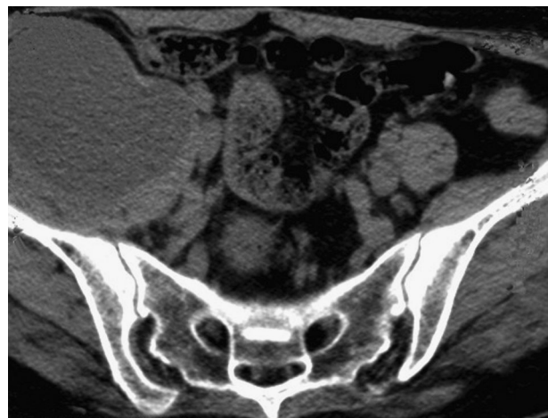
Fig. 2 Computed tomography revealed a giant cold abscess on the right iliac fossa.

Tuberculosis of the spine can cause serious morbidity, such as permanent neurologic deficits and severe deformity.