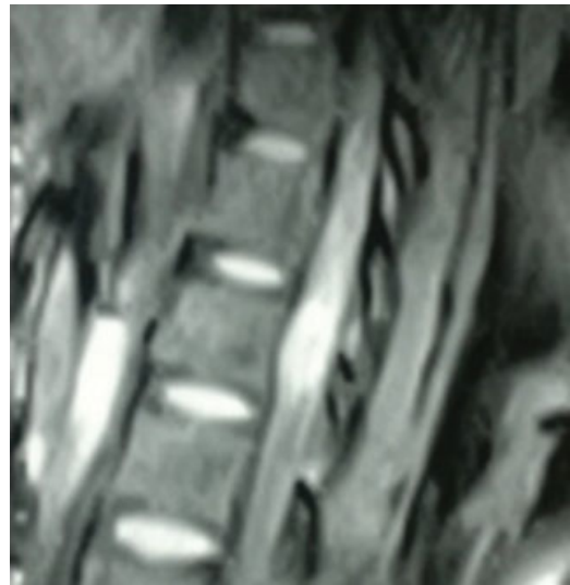
Fig. 2 Magnetic resonance image of the spinal cord T2-weighted sagittal image showing an enlargement of the conus heterogeneous enhancement.

A histological analysis of the specimens was performed. On hematoxylin and eosin (H&E) stained section, areas of granulomatous inflammatory reaction and necrosis were observed (►Fig. 3). Areas suspicious for fungal organisms were visualized on sections. Capsulatum DNA was detected and prolonged fungal culture ultimately grew out Histoplasma capsulatum organisms. Final diagnosis was spinal cord compression caused by Histoplasma capsulatum .