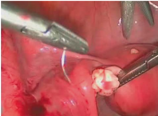
Fig. 2 Orthotopic transplantation into the remaining ovary.