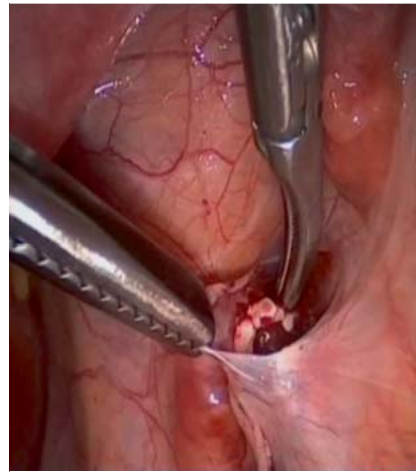
Fig. 3 Transplantation of ovarian tissue into a peritoneal pocket in the region of the abdominal wall near the ovary.

cation. They considered vitrification as the standard procedure for the cryopreservation of oocytes [38]. According to a review by Cobo et al. published in 2009, oocyte survival rates after vitrification were 97% with an open vitrification system, a significantly higher rate than the 75% rate obtained with a closed system [39]. According to recent data, the pregnancy rate after transfer of vitrified fertilized oocytes was 38% [40]. According to Cobo et al., it was even possible to achieve a clinical pregnancy rate of around 60% for oocytes of equal quality after ovum donation [41]. Conversely, this also means that on average only half of all women who undergo harvesting of oocytes for fertility preservation will become pregnant; this is an issue women need to be informed about in advance.