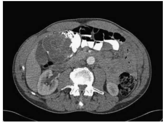
Fig. 1 Computerized tomographic scanning shows a complex inflammatory mass without abscess or perforation in the cecum of a patient with gastrointestinal Behcet disease.

Several imaging modalities can be used to assist the diagnosis of intestinal BD, including barium swallow, barium enema, or computed tomography/magnetic resonance imaging (CT/MRI). 14 CT and MRI scans are useful for demonstrating