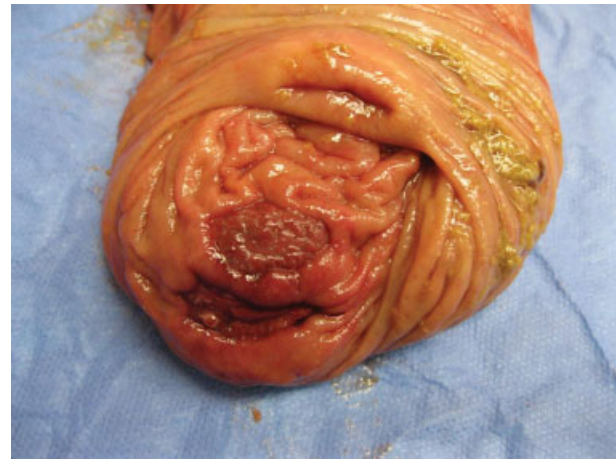
Fig. 3 Right colon and terminal ileum surgical specimen from a patient with gastrointestinal Behcet disease shows focal ulceration in the proximal ascending colon consistent with ischemic ulcer.

Despite subtle differences, distinguishing between both, diagnosis may not be possible.