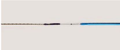
Fig. 1 The tip of the balloon catheter is only 3 Fr in diameter, tapered, and coaxial with the 0.025-in guidewire.

For performance of endoscopic ultrasound-guided biliary drainage (EUS-BD), such as with EUS-guided hepaticogastrostomy (EUS-HG) [1,2], the fistula must be dilated so that the stent delivery system can be inserted [3]. We demonstrate herein a simplified technique for performing EUS-BD with a novel fine-gauge balloon catheter (REN Biliary Dilation Catheter; Kaneka Corporation, Osaka, Japan). This balloon catheter is designed for use coaxially with a 0.025-inch guidewire (▶ Fig. 1), having a lumen through which the guidewire can be advanced. In addition the catheter tip is only 3 Fr in diameter and is tapered. For an EUS-BD procedure, the dilation device must have a fine gauge and adequate stiffness to dilate the fistula. After the bile duct has been punctured with a 19-gauge aspiration needle, this balloon catheter can easily be inserted without any dilation devices. Therefore, the risk for bile leakage from the fistula may be decreased because no device exchange is needed and the procedure time is reduced.