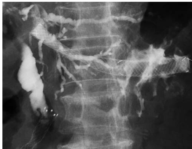
Fig. 3 Endoscopic ultrasound-guided hepaticogastrostomy is completed.