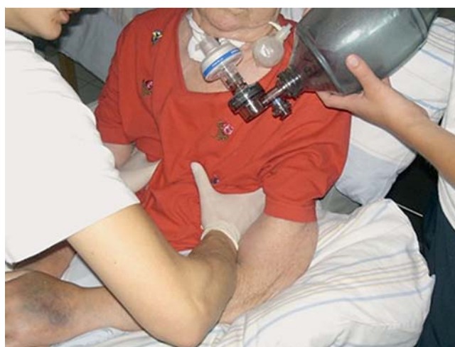
Fig. 2 Bagging: manual cough support on the chest during active coughing or (if not possible) during exhalation to enforce expectoration of mobilized bronchial secretions.

[35]. This tool assesses alertness, basic motor responses, reactions to acoustic, visual and tactile stimuli, and motor speech responses. The quality of bronchial secretions was assessed with a custom-made 5-point rating scale, as, to our knowledge, no similarly differentiated and validated secretion rating scale is reported in the literature. Secretions were rated according to their viscosity, as being thick (score 1), ropery (score 2), gel-like (score 3), saliva-like (4) or watery (score 5). Secretion qualities in the range of score 3 (gel-like) to score 4 (saliva-like) were clinically based interpreted as reflecting a more natural and physiological secretion quality than the other scores. Due to its lack of validation, the secretion score data was analysed descriptively only.