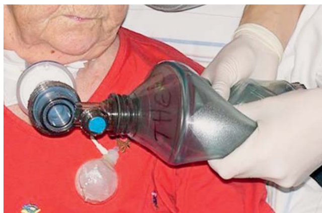
Fig. 1 Bagging: hyperinflation during active inspiration with a resuscitation bag attached to the tracheostomy tube.

The experimental parameters collected are shown in ► Table 1 (see [28] for an overview of normal values for parameters 1–4). Blood gases were obtained by capillary blood gas analysis and pulse oximetry. Respiratory rates were counted over 10 minutes in a resting period and analyzed as the mean per minute. Swallowing frequency was determined by visual observation of laryngeal elevations in a 10 minutes resting period and as well analyzed as the mean per minute. The normal values used as a reference for swallowing frequency were the calculated mean and 95 % confidence interval (CI) of data for non-nutritive swallows in awake healthy adults in the sitting position as reported in the literature ( M=1.17/\text{min} ( SD=.53 ; 95%CI [0.74–1.60]) [29–34]. The patients' vigilance was assessed using the "Coma Remissions Skala" (Coma Remission Scale), a rating scale ranging from 0 points (most severe impairment) to 24 points (no impairment)