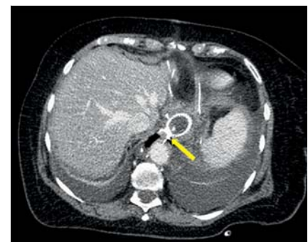
Fig. 4 Computed tomography scan showing the implanted esophageal stent and the rotated branch protruding toward the aorta (yellow arrow).