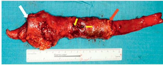
Fig. 2 Resected esophageal specimen containing the implanted esophageal stent (cranial margin: red arrow; bulged out caudal margin: white arrow) and the migrated clip through the esophageal leak (yellow arrows).

Emergency surgery revealed that the clip had rotated by almost 180 degrees and one branch had protruded toward the aorta, causing an irreparable esophagoaortic fistula (Fig. 1). Emergency esophagectomy was performed to expose