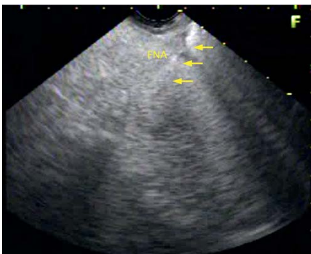
Fig. 3 Endoscopic ultrasound-guided fine-needle aspiration of the right-sided supra-diaphragmatic lesion. FNA, fine-needle aspiration.

A 48-year-old woman with chest pain for the preceding 2 months and a previous history of hereditary spherocytosis was referred for endoscopic ultrasound (EUS) to evaluate mediastinal lymphadenopathy and a heterogeneous mediastinal mass diagnosed by computed tomography (CT). EUS (Fujinon, Saitama City, Japan) showed a hyperechogenic and heterogeneous peri-esophageal, supra-diaphragmatic lesion (● Fig. 1) and a peri-aortic/vertebral lesion (● Fig. 2). EUS also demonstrated multiple lymph nodes in the para-esophageal, subcarinal, and right high paratracheal regions, suggesting a reactive process. The patient underwent EUS-guided fine-needle aspiration (EUS-FNA) of the right supra-diaphragmatic lesion, performed with a 19-gauge needle (Cook Medical, Limerick, Ireland) (● Fig. 3). Analysis of the histologic sections confirmed the diagnosis of extramedullary hematopoiesis in the mediastinum (● Fig. 4).