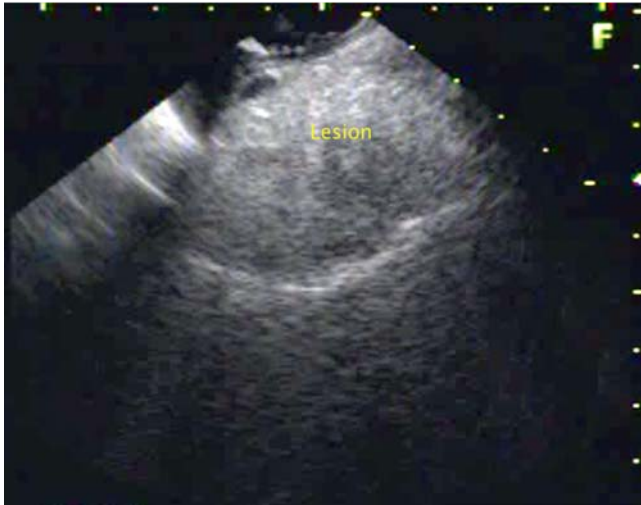
Fig. 1 Endoscopic ultrasound showing a right-sided peri-esophageal, supra-diaphragmatic lesion in a patient with extramedullary hematopoiesis. Note the hyperechogenic appearance of the lesion.