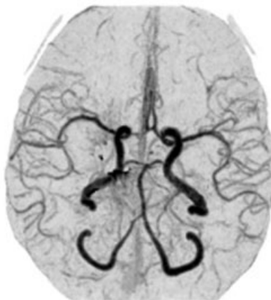
Fig. 2 Relation of the shrapnel to vascular structures in computed tomography angiography.

Elston reported 20 cases with traumatic third nerve palsy, but no penetrating injury was present in their etiology. 9 In 1400 case presentations, Keane reported traumatic oculomotor injuries in 26%. Among those traumatic cases with gunshot injury, there were 28 cases with direct (injury form not specified) oculomotor nerve injury and 5 cases with oculo-