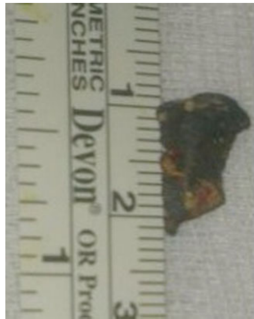
Fig. 3 The shrapnel.

motor nerve injuries secondary to herniation. 2,8 In our case, pressure and/or blast impact caused by the shrapnel on the subarachnoid segment of the third nerve caused the palsy. It is very fortunate for the patient that the shrapnel did not damage vascular structures such as the ICA, basilar artery, and vital structures including the brain. The sharp-edged shrapnel was removed by microsurgery due to its risk of causing damage in the vascular-neural structures by pulsation and/or displacement. Pressure-dependent oculomotor palsy can be resolved by removing the pressure. 10 However, in nonresolving oculomotor palsy, an extraocular muscle surgery may be required to restore binocular vision and the position of the eyes. 2 In third nerve palsy induced by trauma, an aberrant regeneration develops in 65% of cases. 8 In our case, a partial recovery by an aberrant third nerve regeneration developed at month 9: horizontal gaze-eyelid synkinesis, pseudo-Von Graefe phenomenon (elevation of the lid on downward gaze), and limited elevation and depression of the eye with retraction of the globe with attempted vertical movements. The signs of nerve fiber misdirection may appear months to years after the third nerve injury occurs. Misdirection of