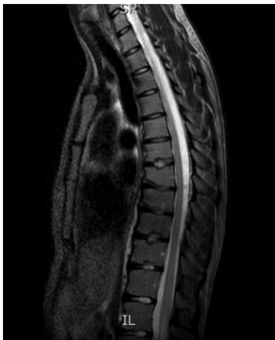
Fig. 2 Thoracic magnetic resonance imaging revealing multiple Schmorl's nodules and small disc herniation at T7–8.

a Kjaer et al (2005) reported intermediate/hypointense signal intensity and Tertti et al (1990) reported "abnormal discs"; these findings were determined to be indicative of degenerative disc disease and included in this category.