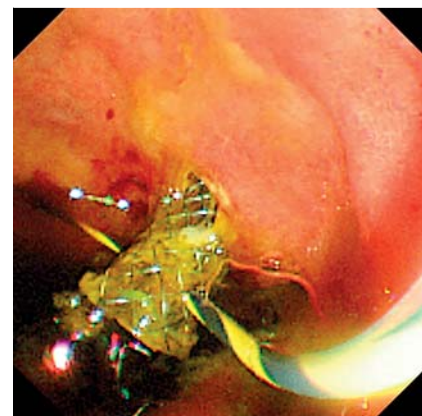
Fig. 2 An endoscopic retrograde cholangiopancreatography (ERCP) cannula was used to puncture the mesh wall of the covered self-expandable metal stent (SEMS). A guidewire was then passed through the mesh wall and the opposite wall of the metal stent.