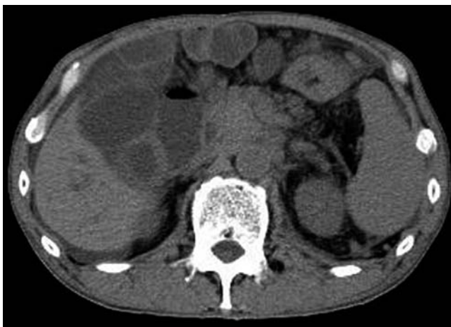
Fig. 2 Computed tomography (CT) scan showing malignant afferent-loop obstruction.

A 64-year old man was admitted to our hospital because of acute cholangitis. He had previously undergone pancreatoduodenectomy with Roux-en-Y reconstruction for a pancreatic neuroendocrine carcinoma (▶ Fig. 1 ). A computed tomography (CT) scan revealed afferent-loop obstruction due to lymph node metastases (▶ Fig. 2 ).