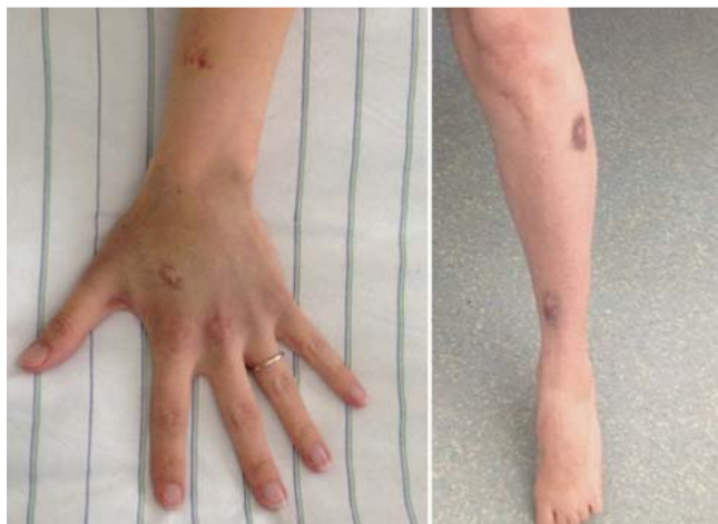
Fig. 1 Spontaneous haematomas shortly after admission of the patient.

branes. Clinical examination did not reveal any further complaints. She did not suffer from headache or upper abdominal pain. Her vital signs were normal. Previous diseases, and coagulopathies in particular, were not known and the family history was inconspicuous. She was not taking any medication. A blood analysis in the first trimester had been normal.