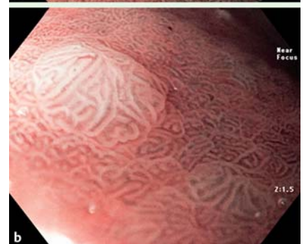
Fig. 3 a, b High-magnification dual-focus narrow band imaging of isolated flat lesions (2 mm diameter) with a subtle villous-like morphology and the appearance of light blue crests.