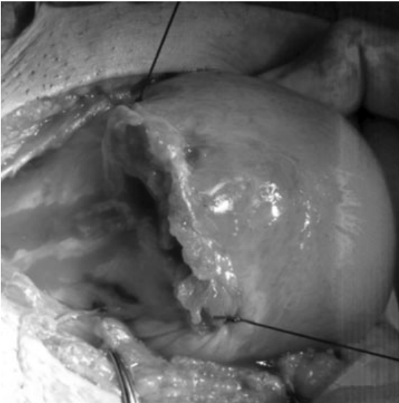
Fig. 3 Uterine rupture with complete opening of the uterine wall at the site of the previous transverse scar.

uterine incision. The frequency of uterine rupture is approximately 1% with previous low-segment transverse cesarean section during labor and approximately 4 to 9% with a vertical or T-shaped section. 1 The subsequent pregnancy outcome after conservative management of uterine rupture has only been studied in several small case series, among which the prevalence of recurrence is in a wide range of approximately 0 to 33%. 2,3