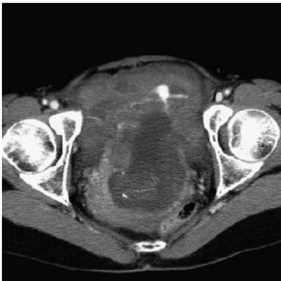
Fig. 2 Dynamic computed tomography revealing discontinuity of the uterine muscle layer in the lower uterine segment.

While the patient was being prepared for emergency laparotomy, her blood pressure suddenly decreased to 78/51 mm Hg and her heart rate increased. Therefore, aggressive resuscitation for hypovolemic shock was required. At the time of the operation, uterine rupture with complete opening of the uterine wall at the site of the previous transverse scar was found (►Fig. 3). The fetus within the amniotic sac showed no cardiac activity and was located in a blood-filled abdominal cavity. The total amount of the hemorrhage in the abdominal cavity was approximately 3 L. After the fetus and placenta were removed, the uterine scar was repaired using a double-layer closure. During the preoperative, intraoperative, and postoperative periods, the patient received a total amount of 10 units of packed red blood cells and 6 units of fresh frozen plasma for the resuscitation. She recovered without any complications and was discharged on the eighth postoperative day.