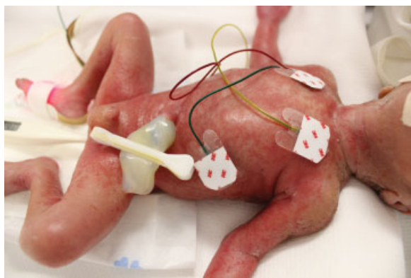
Fig. 1 At birth, diffusely distributed erythematous papules and pustules were present on the infant's face, trunk, and extremities.

in respiratory distress. The infant was intubated, and an endotracheal surfactant was administered. He had diffusely distributed erythematous papules and pustules on his face, trunk, and extremities (►Fig. 1). His total blood cell count included a total leukocyte count of 4.3 \times 10^9/L with 7.5% band forms, 43.0% polymorphonuclear leukocytes, and 33.5% lymphocytes, and a platelet count of 255 \times 10^9/L . A laboratory examination revealed a C-reactive protein level of 0.26 mg/dL and an immunoglobulin M (IgM) level of 3 mg/dL. A blood culture was negative. Culture samples obtained from the skin, pharyngeal mucus, gastric fluid, and tracheal aspirates were subsequently found to be positive for Candida albicans . Empiric antibiotic therapy with flomoxef was initiated according to our routine protocol. As the infant's skin lesions were characteristic of Candida infection, intravenous fluconazole (4 mg/kg) was promptly administered. Clotrimazole was also used to treat the patient's skin lesions. After 1 day, his erythematous papules and pustules had markedly improved. Fluconazole was administered every third day for the first 7 days of life, which resulted in improvements in the patient's skin lesions and laboratory data. No major complications, such as patent ductus arteriosus, intraventricular hemorrhage, or fungal infection recurrence, were observed during the neonatal period. The infant was successfully extubated after 42 days of mechanical ventilation and placed on