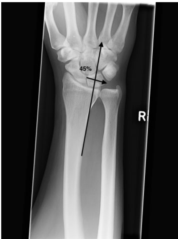
Fig. 4 A line is drawn parallel to the ulnar aspect of the radius proximal to the metaphyseal flare and extrapolated distally into the proximal row of the carpus. The point of intersection within the lunate is evaluated by drawing a second line along the transverse width of the lunate on the AP radiograph that is parallel with the distal radial articulation. The percentage of lunate radial to this line is calculated.

lunate, meaning that between 50–70 percent of the lunate was ulnar to the reference line from the radial shaft. Fourteen percent measured a shaft intersection between 51–60 percent of the lunate. Eight percent of wrists measured had a shaft intersection point > 60 percent. No shaft intersection points were measured below 25 percent or above 73.68 percent of the lunate width.