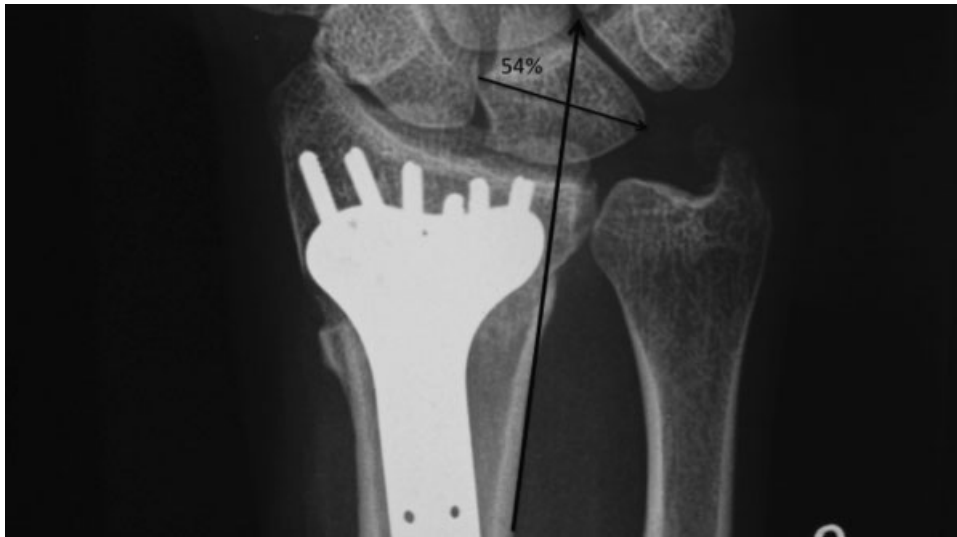
Fig. 3 Radial translation osteotomy for DRUJ instability with successful stability achieved with no ulnar-sided procedure.

For all individuals studied, the point of intersection had a mean of 45.48% (SD = 9.6%; range 25–73.68%) of the lunate remaining on the radial side and a mode of 50% (►Fig. 5).