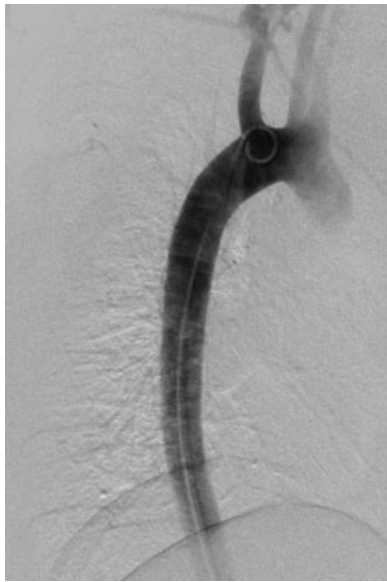
Fig. 3 Intraoperative aortography demonstrates no extravasation of contrast and normal filling of the descending thoracic aorta.