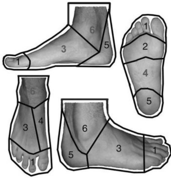
Fig. 1 Zones of the distal lower extremity including foot and ankle. 22 Zone 1, distal foot and toes; zone 2, plantar forefoot; zone 3, dorsal foot; zone 4, midfoot; zone 5, hind foot; and zone 6, distal leg and ankle.

Therefore, after incising only the anterior border of the MSAP flap through the subcutaneous tissues, a subfacial dissection may be the safest approach to first confirm the exact location of the perforator. Often, the actual site of facial perforation is different than suspected, so the design must be correspondingly altered. Next, the usual tedious intramuscular dissection of these relatively diminutive perforators back to a branch of the medial sural vessels must be completed until the desired pedicle length and/or vessel caliber is obtained. Any motor nerves encountered are carefully protected. The posterior boundary can then be incised through the deep fascia to create an island flap. At the superior flap margin, a large subcutaneous vein, if encountered, should be kept to permit flap venous supercharging later if needed, although this maneuver is rarely required. The tourniquet is next deflated and flap perfusion assessed. If adequate, transfer to the recipient defect with the requisite microanastomosis is performed per routine. Donor site closure requires a skin graft if primary closure is too tight to avoid an iatrogenic compartment syndrome. 21