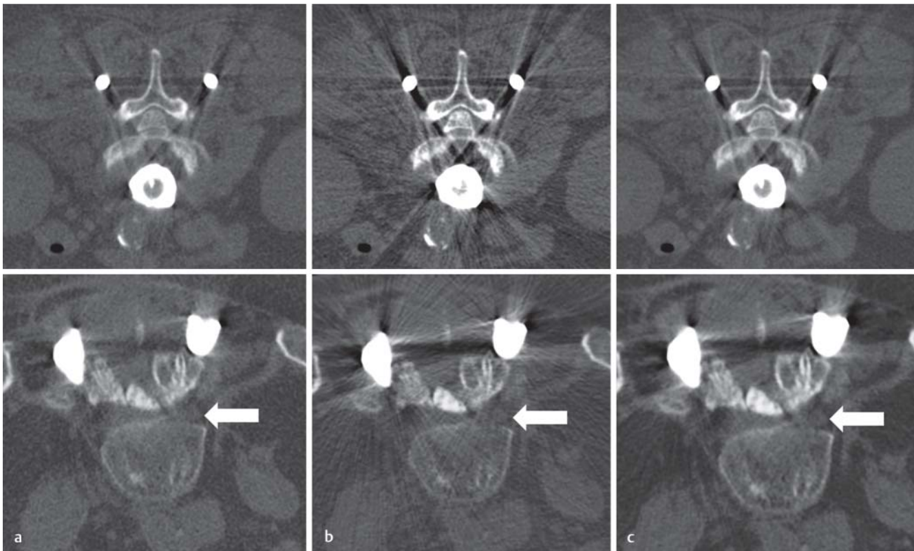
Fig. 2 Axial views of the spinal foramina with 140 kV a , 80 kV b and the virtual 120 kV series c in two different patients. Arrows are pointing to the nerve roots. In this example beam hardening artifacts lead to no disturbance in the 140 kV series, a severe disturbance in the 80 kV series and a slight disturbance in the virtual series.

Abb. 1 Axiale Darstellung des Spinalkanals mit 140 kV a , 80 kV b und der virtuellen 120 kV c Serie. In diesem Beispiel führen Aufhärtingsartefakte zu einer geringen Einschränkung in der 140 kV Serie, zu einer deutlichen in der 80 kV Serie und einer moderaten in der virtuellen Serie.