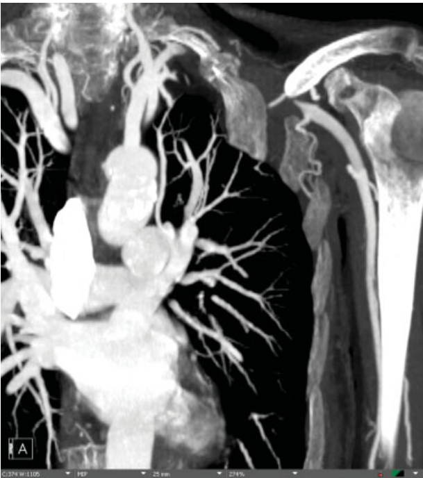
Fig. 2 Pre-OP computed tomography angiogram: coronal 25 mm maximum intensity projection slab showing the occlusion of the subclavian artery.

zones. The postoperative course was uneventful and the patient was referred to plastic surgery for finger amputation on postoperative day 4.