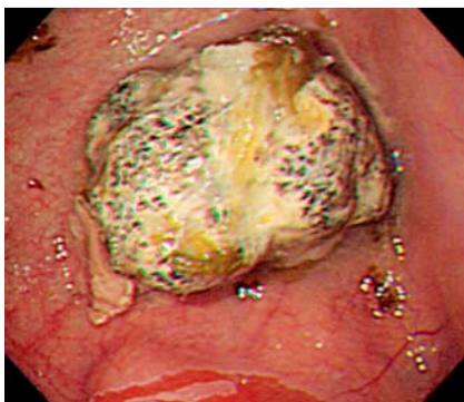
Fig. 2 Blackish, 3-cm long bezoar in the diverticulum.

A 57-year-old woman presented with dysphagia and postprandial epigastric fullness for about two years. Esophagogastroduodenoscopy (EGD) showed an esophageal diverticulum at the lower portion of the esophagus, and barium swallow esophagography showed a focal out-pouching space (measured about 5 cm in size) at the distal third of the esophagus near the esophagogastric junction (● Fig. 1). The patient reported having nausea and vomiting after eating in the past 2 days. She underwent another EGD, which revealed a 3-cm, blackish bezoar impacted in the esophageal diverticulum (● Fig. 2). The bezoar was removed with a snare basket. On reviewing her history, it was found that she had been taking Pho Pu Zi ( Cordia dichotoma Forst. f.) as an appetizer for a month. Esophageal diverticulum is a rare esophageal disease and can occur anywhere in the esophagus [1]. The epiphrenic diverticulum is an acquired pulsion diverticulum that occurs near the diaphragmatic hiatus [1]. In about 80% of patients it is