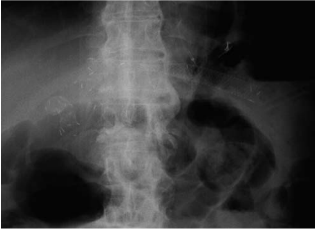
Fig. 1 Radiographic image showing the position of the self-expandable metal stent (SEMS) after endoscopic ultrasound (EUS)-guided hepaticogastrostomy in a patient with cancer of the pancreatic head who had previously undergone pancreaticoduodenectomy and hepaticojejunostomy.