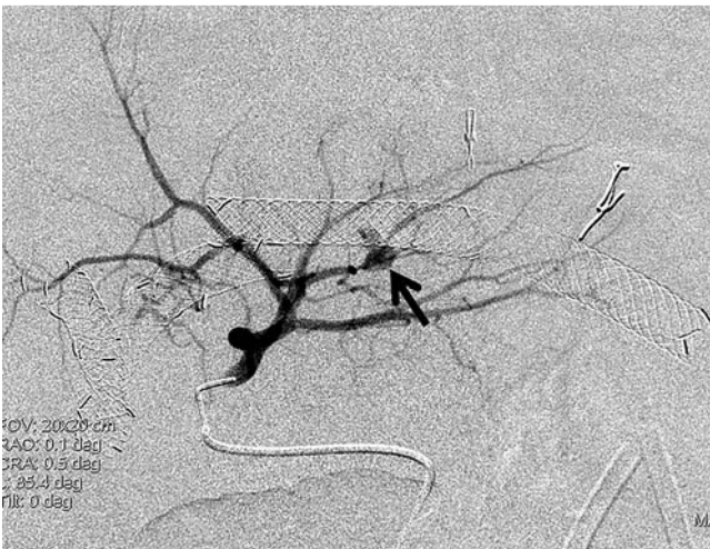
Fig. 3 Left hepatic angiogram showing a pseudoaneurysm (arrow) originating from a small branch of the left hepatic artery adjacent to the stent.

A 66-year-old man, who had undergone pylorus-preserving pancreaticoduodenectomy with Roux-en-Y hepaticojejunostomy for cancer of the pancreatic head, developed recurrent obstructive jaundice. He underwent balloon-assisted endoscopic retrograde cholangiopancreatography (ERCP) with insertion of bilateral self-expandable metal stents (SEMSs). Following this, he was admitted again because of recurrent cholangitis; on this occasion, he underwent endoscopic ultrasound (EUS)-guided hepaticogastrostomy (EUS-HG) for biliary drainage. The procedure was carried out under EUS and fluoroscopic guidance using a curvilinear echoscope (GF UC-140P; Olympus, Tokyo, Japan). After segment II of left intrahepatic