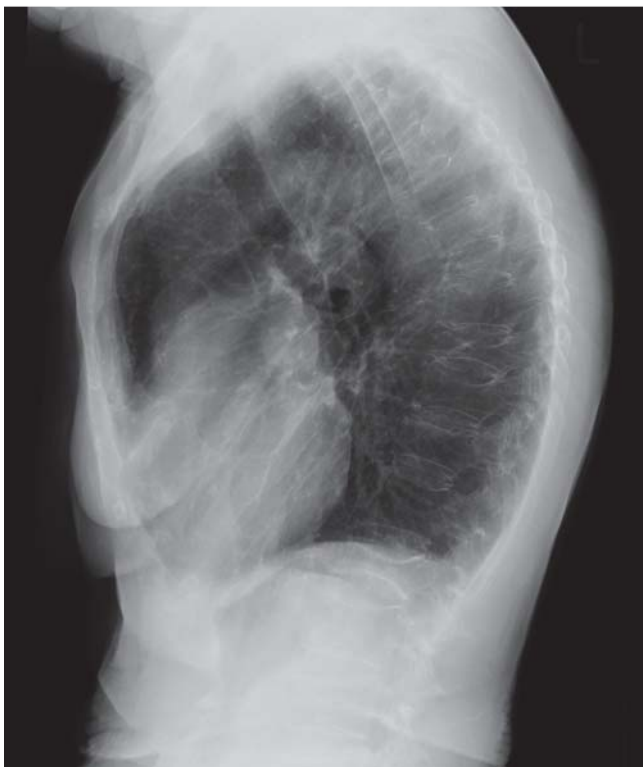
Fig. 3 63-year-old woman with multiple vertebral fractures (Genant severity = 1: T5, T6, T12, L3; Genant severity = 2: T3, T7, T11; Genant severity = 3: T8, T10, L2) that was correctly reported by R1 after the training (group 2).

derwent training). It can thus be concluded that while the teaching initiative facilitated improved detection of patients with osteoporotic vertebral fractures (see rise in kappa val-