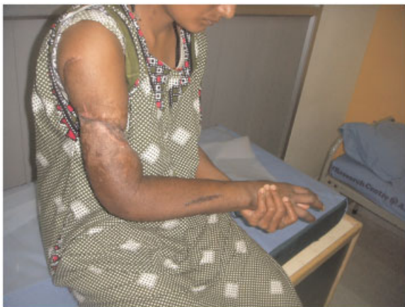
Fig. 2 Four months postop following replantation.

patients required additional colloid (hetastarch 6%) transfusion. Heparin was used in 11 patients, and low molecular weight heparin in 1. None had altered PT, INR, or aPTT.