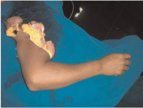
Fig. 1 Traumatic crush amputation at arm level in a 35-year-old woman (Patient 14) due to road traffic accident. Warm and cold ischemia time were 120 minutes and 660 minutes, respectively, and there was no reperfusion event.