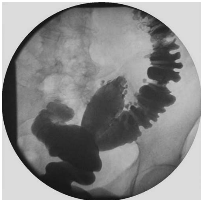
Fig. 4 Follow-up lower gastrointestinal radiographic view showing successful long-term closure of the fistula.

nal series performed 4 days later failed to show the fistula and the patient was discharged. At 3 months, a lower gastrointestinal series confirmed successful long-term closure (▶ Fig. 4 ). To our knowledge this is the first reported case of a long gastrocolic fistula being repaired via this novel method of dual endoscopic closure with use of Resolution clips.