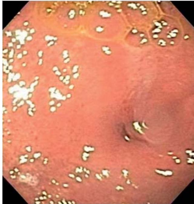
Fig. 2 Endoscopic view showing the gastric fistula orifice on the greater curvature of the stomach.

A 72-year-old man with a history of diverticulitis 1 year previously, requiring a partial colectomy, presented to our hospital complaining of fever and weight loss over the preceding 3 weeks. Blood cultures revealed Gram-negative bacteremia. Antibiotics were initiated and a complete workup for infectious diseases was done without any success. Barium imaging and computed tomography (CT) of his abdomen revealed a 14-cm long fistulous tract extending from the greater curvature of the stomach to the area of the sigmoid colon (● Fig. 1 ). It was felt that the