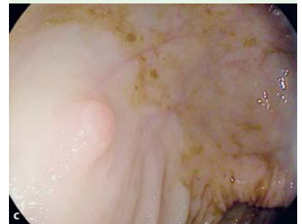
Fig. 2 Colonoscopy images: a protruding mass at ileocolonic anastomosis, b ulceration within blind loop at ileocolonic anastomosis, and c sessile polyp at sigmoid colon.

involvement in T-cell lymphoma is extremely rare [4], and endoscopic findings of multiple concentric rings in the esophagus due to T-cell lymphoma have to the best of our knowledge never been reported in the literature.