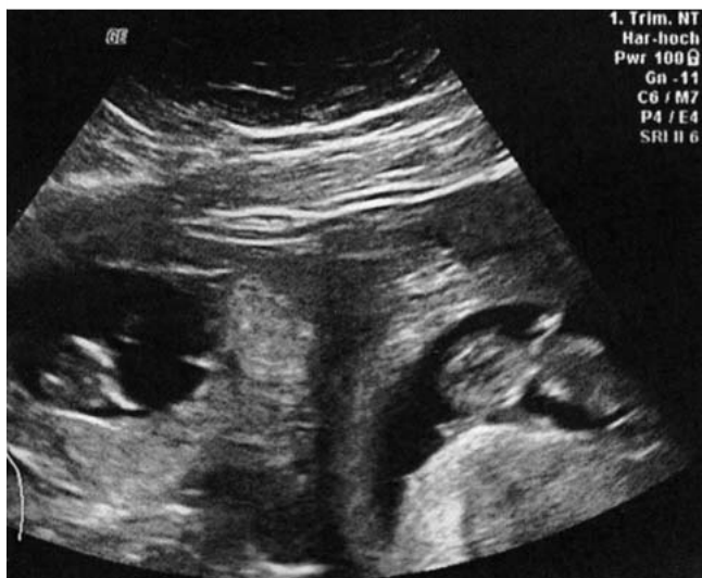
Fig. 1 Abdominal ultrasound: intact extrauterine and intact intrauterine pregnancy.

and extrauterine fetuses in a spontaneously occurring pregnancy.