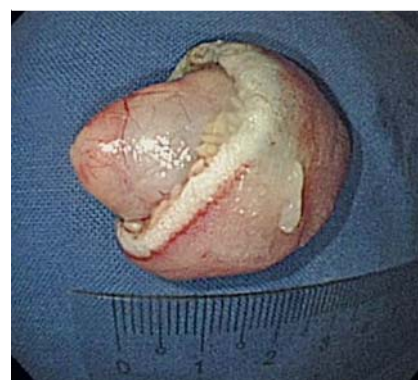
Fig. 3 The retrieved resected specimen. The final diagnosis was Brunner's gland adenoma.