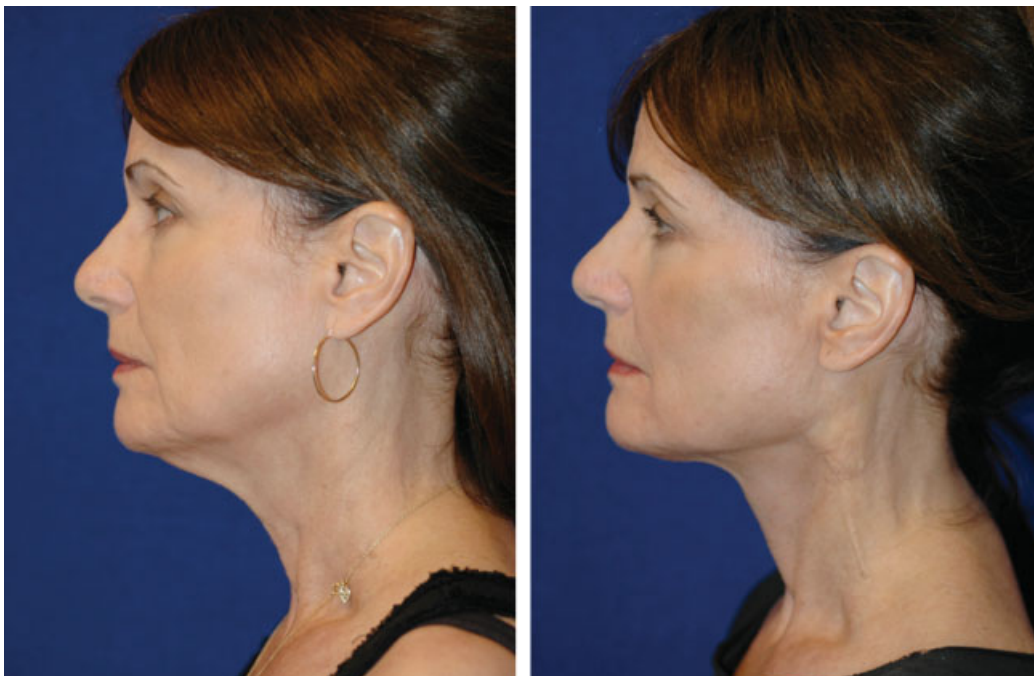
Figure 7 Preoperative (left) and 4-month postoperative (right) lateral views of a subject after our technique with concomitant rhytidectomy.