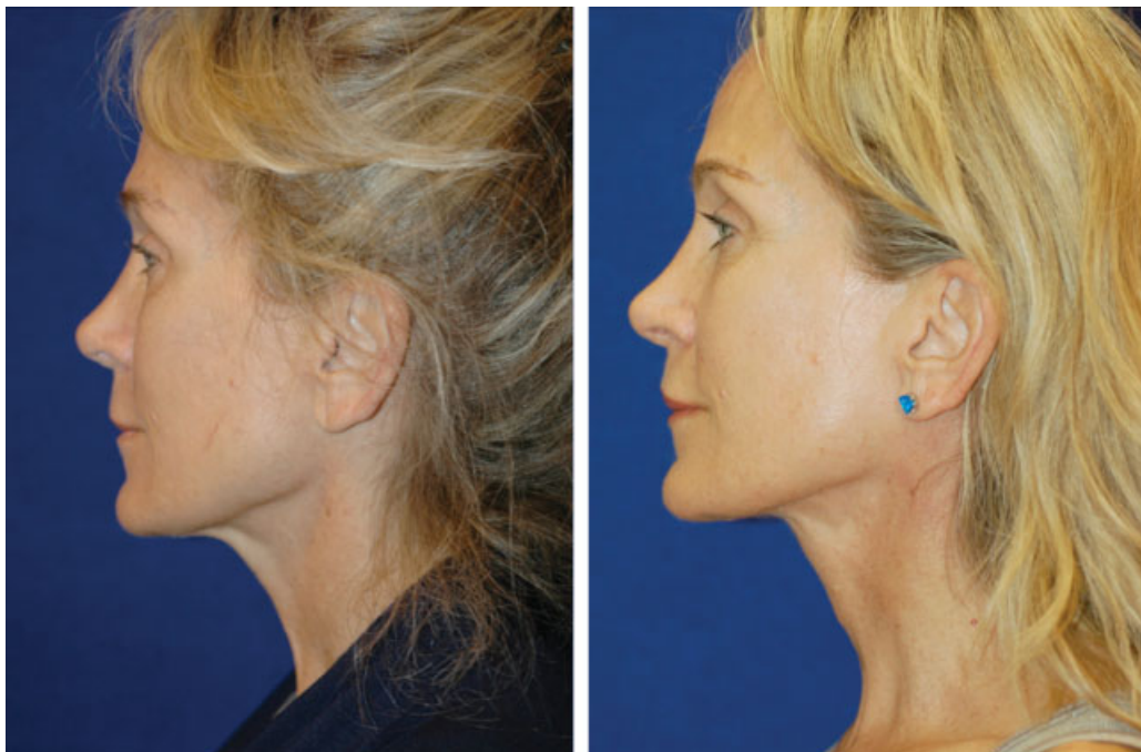
Figure 5 Preoperative (left) and postoperative (right) lateral views of the same subject.

We report our early experiences with use of a percutaneously placed spanning suture in the neck combined with a posterior platysmal pull. Outcomes have been favorable, due to its ease