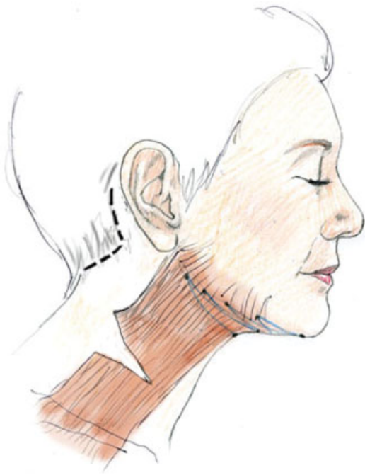
Figure 2 A full-thickness cut across the platysma muscle at the level of the cricoid is necessary for addressing platysmal banding.