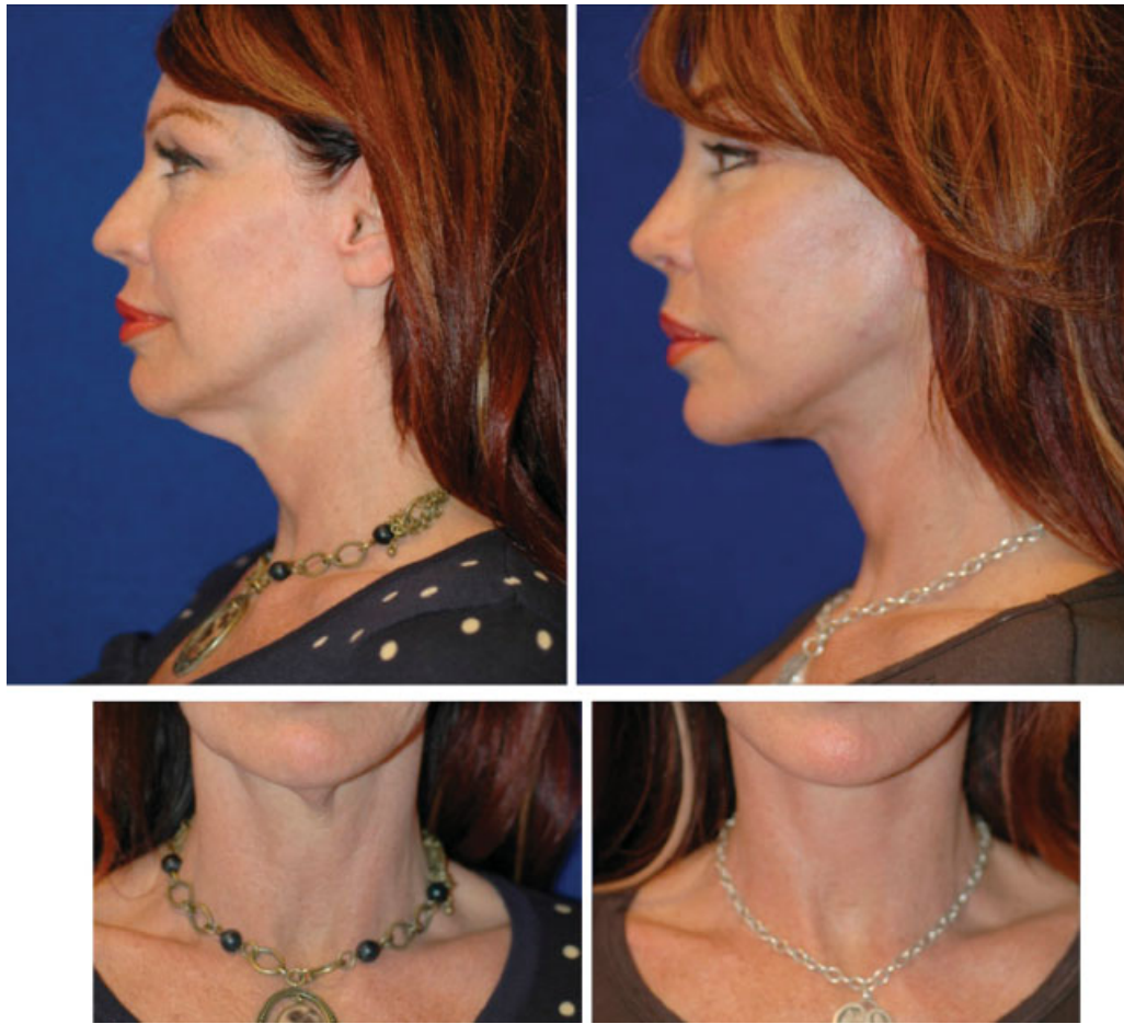
Figure 6 Preoperative (left) and postoperative (right) frontal and lateral views of a subject after treatment of her aging neck with our technique. She also underwent revision rhytidectomy at the time of procedure.