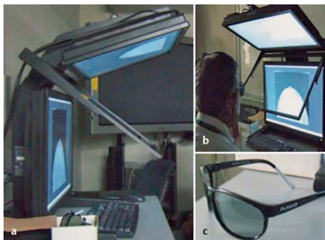
Fig. 3 a to c 3D digital full field mammography. Monitoring with mammographies in the c-c view and c-c view with an angle of plus 4° (stereoscopy), respectively (a and b) with the use of linearly polarised filter glasses in order to obtain a holistic 3D image of the breast (c).

The most important image-producing method for the early diagnosis of breast cancer remains x-ray mammography. It is the only method with proven use as a quality-assured screening method to lower the breast cancer mortality rate. Full-field digital mammography, or FFD, is today regarded as the standard mammographic method, both in curative mammography and in the preventive mammographic screening of women without any symptoms and, in particular, is more effective for the detection of pathological findings in women with dense breasts than standard film foil mammography [1–6]. Nonetheless, as with all radiological projection methods, digital mammography suffers from the fact that it depicts three-dimensional information as a two-