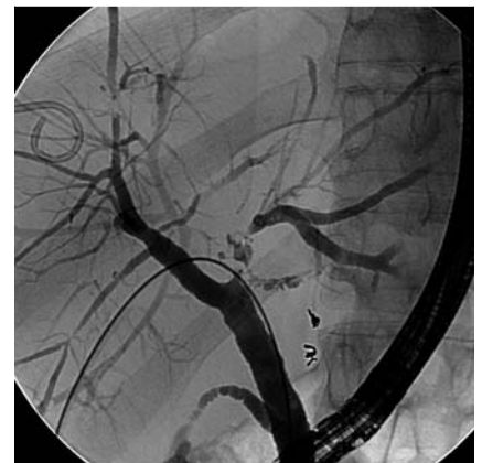
Fig. 4 A severe irregular stricture seen at the origin of the left hepatic duct with associated debris and anomalous anatomy with the right posterior hepatic duct arising from the left main hepatic duct.