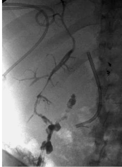
Fig. 1 Opacification of an irregular biloma communicating with the right posterior hepatic ducts.

This is the first report of successful closure of a bilio-cutaneous fistula using a rendezvous technique. Treatment with endoscopic stents alone failed due to inability