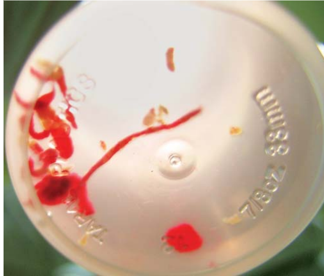
Fig. 1 Macroscopic view of EUS-guided liver biopsy core in an elderly woman with elevated liver function tests.

Despite the advancement of less invasive diagnostic tools [2], liver biopsy is still the gold standard for diagnosis of benign liver parenchymal disease. Recently, EUS-guided liver biopsy using the Tru-cut needle has been reported [3,4]. One of the limitations of EUS-guided FNB is the needle size. In addition, the Tru-cut needle allows only a one-shot biopsy with a 20-mm-long tray. The new histology needle can potentially obtain longer specimens via multiple to-and-fro movements, analogous to a cheese grater, with the hollow of the needle. Fan-like movement of the needle can also increase the sampling area through one puncture site. Theoretically, the small needle and single puncture under EUS guidance may result in fewer bleeding complications. Patients who require endoscopy for other reasons may be candidates for EUS-guided liver biopsy. The feasibility of this 19-gauge histology needle [5] has been reported,