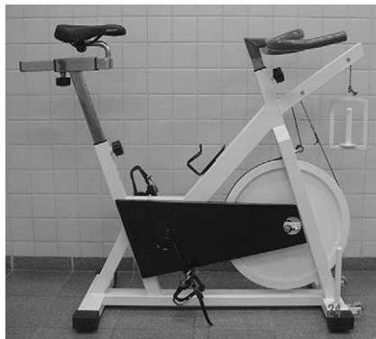
Fig. 1 Indoor cycling bicycle ergometer (ICBE).