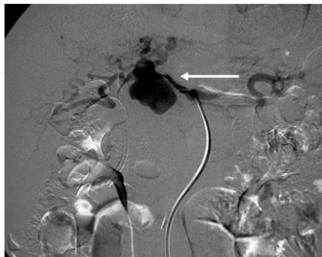
Fig. 3 Angiogram showing the hepatic artery aneurysm (arrow) (large size, 4 x 5 cm).