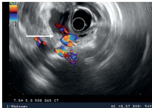
Fig. 2 Radial echo-ultrasonography with color Doppler showing typical to-and-fro flow in a large cystic lesion (arrow) communicating with the hepatic artery.