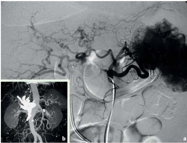
Fig. 4 a Angiogram taken after glue injection demonstrating complete occlusion of the hepatic artery aneurysm with collateral circulation from the celiac trunk to the hepatic artery. b Computed tomography (CT) scan at 3 months after injection showing the staining due to the residual glue inside the lesion.

A percutaneous injection of Histoacryl was given directly into the aneurysm (● Fig. 4).