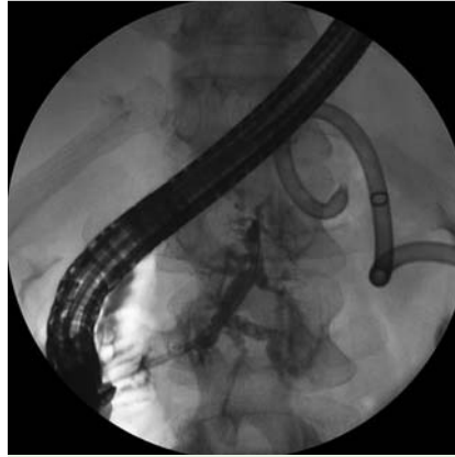
Fig. 1 Total obstruction of the main pancreatic duct, which is opacified via the minor papilla. In the background, a transgastric double-pig-tail stent is seen in the collection.

A long, plastic, single-pig-tail stent was then placed to bridge the rupture and drain the entire pancreatic duct (● Fig. 4). Eventually, the patient's pain resolved and 10-Fr stent exchanges were carried out every 6 months for 2 years, with no further symptoms.