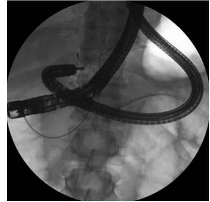
Fig. 3 Dual-scope rendezvous technique: A guide wire inserted via the minor papilla with the duodenoscope has been caught by the gastroscope with a pair of forceps to help advance it in the pancreatic tail.