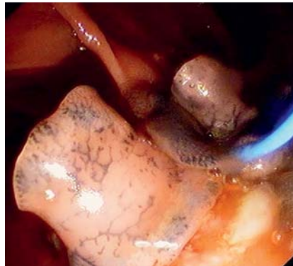
Fig. 2 Endoscopic image of a live Fasciola hepatica emerging from the bile duct during balloon extraction at endoscopic retrograde cholangiopancreatography.

In view of the global increase of migrant populations and international food trade, boundaries between endemic and non-endemic zones for human fascioliasis are being blurred. Hence, diagnosis of human fascioliasis should be strongly suspected in patients presenting with the triad of abdominal pain, hepatomegaly, and hypodense liver parenchymal lesion with or without peripheral eosinophilia even in non-endemic regions.