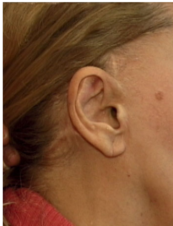
Figure 1 Visible occipital and temporal scars 15 years after rhytidectomy by a noted surgeon that required specific hairstyling for camouflage. Note the distorted appearance caused by posterosuperior transposition of temporal hair and loss of sideburn.

Occipital hairline deformities (Fig. 2) include widened scars in hair-bearing skin, visible hairline scars, or hairline step-offs. These can be corrected by scar excision, appropriate flap advancement/rotation to restore the normal visual continuity of the hairline, and