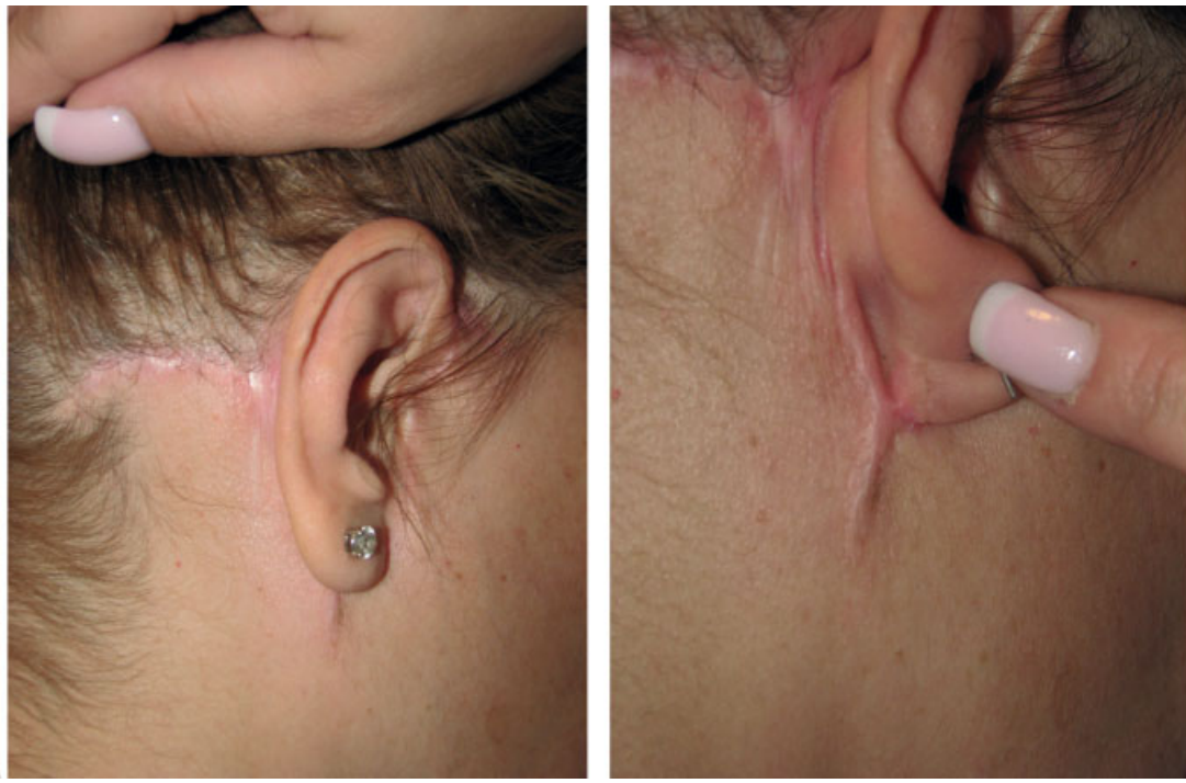
Figure 2 (A) Obvious step-off of the occipital hairline after rhytidectomy caused by poor alignment of the transposed face-lift flap. (B) Hypertrophic scar with sublobular portion.