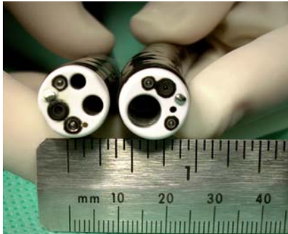
Fig. 1 Note the difference between the 2.8- and 3.7-mm working channels of a conventional therapeutic endoscope (left) and the 6-mm channel of the jumbo therapeutic endoscope (right).

Hemorrhage from small-bowel diverticula is rare and requires a high degree of clinical suspicion and an adequate endoscopic view for the diagnosis [1,2]. Effective endoscopic therapy in this setting, as with most types of upper gastrointestinal bleeding, requires first that the lesion be adequately identified. Unfortunately, blood clot and particulate matter frequently obscure the field of view and prevent identification and treatment of the bleeding source. Conventional upper endoscopes with 2.8- and 3.7-mm working channels are often underpowered to effectively suction and clear blood clots and retained food material. Although repositioning of the patient, use of large-bore lavage tubes, and second look endoscopy after erythromycin infusion are useful adjunctive measures, endoscopically directed clearing of the field with simultaneous viewing would be ideal [3,4]. Recently, a “jumbo-channel” gastroscope (GIF-XTQ160, Olympus Corporation, Tokyo, Japan) has become widely available and boasts a 6-mm working channel for increased effectiveness in evacuating blood clots and debris (▶ Fig. 1).