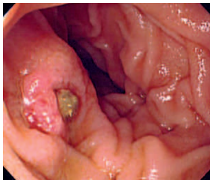
Fig. 2 Endoscopic image, showing a raised lesion covered by normal mucosa with a central ulcer.