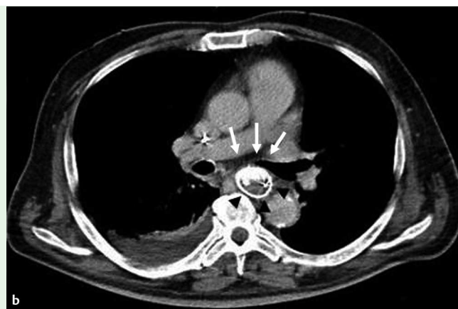
Fig. 2 Bronchoscopic view of left main bronchus with luminal impression of the esophageal stent. b CT scan of the thorax at the level of the tracheal bifurcation showing compression of the left main bronchus (white arrows) by the esophageal stent (black arrowheads).