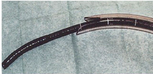
Fig. 2 Soft diverticuloscope (ZD overtube).

This report describes the use of a harmonic scalpel to perform flexible endoscopic diverticulectomy in an acute porcine model. A soft diverticuloscope [4] (ZD overtube, ZDO-22-30; Wilson-Cook, Winston-Salem, North Carolina, USA) (Fig. 2) was employed to provide better exposure of the septum and protection of the anterior esophageal and posterior diverticular walls [5], allowing the passage of the harmonic scalpel (Ultracision ACE36P; Ethicon Endo-Surgery, Inc., Cincinnati, Ohio, USA). Under endoscopic vision (GIF-145, Olympus, Tokyo, Japan) the soft diverticuloscope was brought into position to expose the diverticular bridge. Then, the harmonic scalpel was introduced through the diverticuloscope under endoscopic assistance, which permitted cutting of the diverticular septum up to the fundus of the diverticular sac without bleeding or any sign of perforation