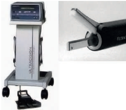
Fig. 1 Harmonic scalpel and the Ultracision generator.

Treatment of Zenker's diverticulum by flexible endoscopy is considered to be feasible and safe [1]. Bleeding and perforation remain the main complications of endoscopic incision of Zenker's diverticulum [2]. The harmonic scalpel (Ultracision) (Fig. 1) has been employed in laparoscopic surgery [3] and provides adequate and accurate hemostasis. The concept of a harmonic scalpel involves coaptive coagulation in which vessels are tamponaded and sealed by a protein coagulum or desiccated tissue, or both. Coagulation with the ultrasonically activated scalpel blade is always coaptive, and vessels are sealed by a denatured protein coagulum [3].