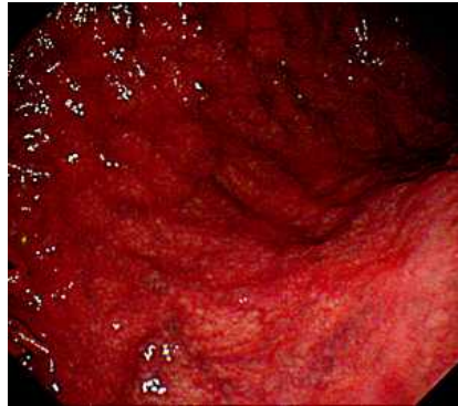
Fig. 1 Endoscopic finding of early gastric cancer. A superficial depressed lesion located in the posterior wall of the lower gastric body was revealed by conventional endoscopy.

A recent study evaluated the use of the IT knife-2 over the original IT knife, reporting a significantly shorter operating time with no significant changes in the en bloc resection and complication rates [4]. The addition of a three-pronged blade directly beneath the insulation tip of the IT knife-2 seems to be the reason for an increased cutting ability from a vertical view, an enhanced lateral cutting capability, and a greater facility to hook the tissue edge prior to cutting (● Fig. 4a and b). However, it is our belief that the perforation reported here would not have occurred if the original IT knife had been used at the time. Therefore, more gentle manipulation than that required with the original IT knife should be adopted during circumferential mucosal incision, especially by endoscopists who are inexperienced in the use of this recently developed device.