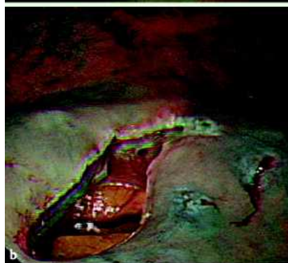
Fig. 2 Circumferential mucosal incision. a Circumferential mucosal incision had just begun using the insulation-tipped (IT) knife-2 from the point of small initial incision made with a needle knife. b Perforation occurred at the beginning of the circumferential mucosal incision.