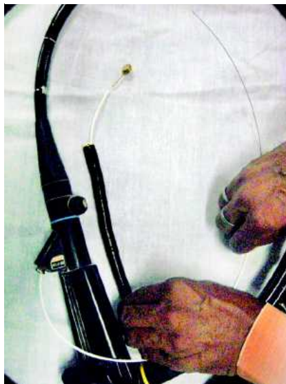
Fig. 2 Upper gastrointestinal endoscope with attached magnetic foreign body retriever.

to get the head of the nail attached to the magnet first. Removal of sharp objects without the use of any protective hood or overtube under fluoroscopic guidance with the help of a magnetic retrieval instrument has not been reported before.