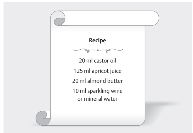
► Fig. 1 Castor oil cocktail recipe.

Clinical data were collected from the electronic patient records. Clinical information collected included maternal age, gravidity, parity, body mass index (BMI), gestational age at delivery, reasons for and methods of IOL. BMI was calculated from maternal height