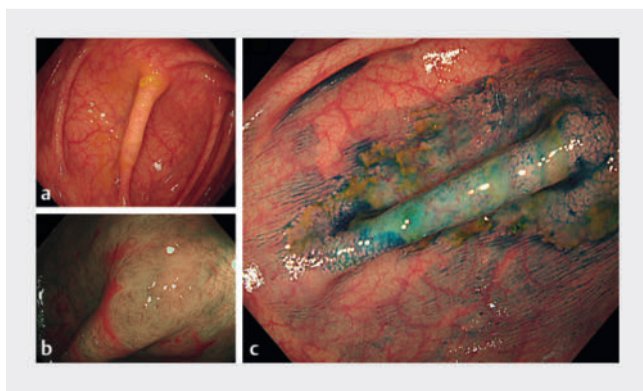
► Fig. 1 Endoscopic images of a large sessile serrated lesion at the hepatic flexure showing on: a white-light imaging, a thick fold covered by mucus; b narrow-band imaging, a cloudy surface pattern with lacy vessels; c chromoendoscopy with indigo carmine spray, the border of the whole lesion now clearly visualized.

At present, only a few studies have explored the prevalence of SSLs in this younger age group [20, 21]; however, in their results, SSLs were mixed with other types of lesions such as hyperplastic polyps (HPPs), and neither of the studies identified clinical risk factors in this population. Therefore, our study aimed to address this research gap by examining the prevalence of SSLs and identifying any potential clinical risk factors associated with SSLs in younger individuals. During 2018–2022, our institute achieved a noteworthy SSL detection rate