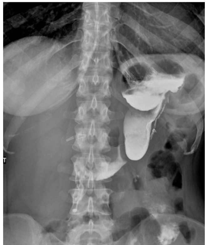
► Fig. 3 Postoperative barium study showing the decreasing of the mid-gastric twist.

The four patients included had been previously managed by endoscopic techniques, which did not improve their symptoms: one patient had one session, and another one had two sessions of dilatation with a 15-mm hydraulic balloon; two patients had benefited from pneumatic dilatation (diameter 30 mm). In two patients, the severe under-nutrition caused by the presence of the mid-gastric twist required the implementation of long-term parenteral nutrition (PN); these patients had not been able to be weaned from their artificial nutrition after the initial endoscopic treatment.